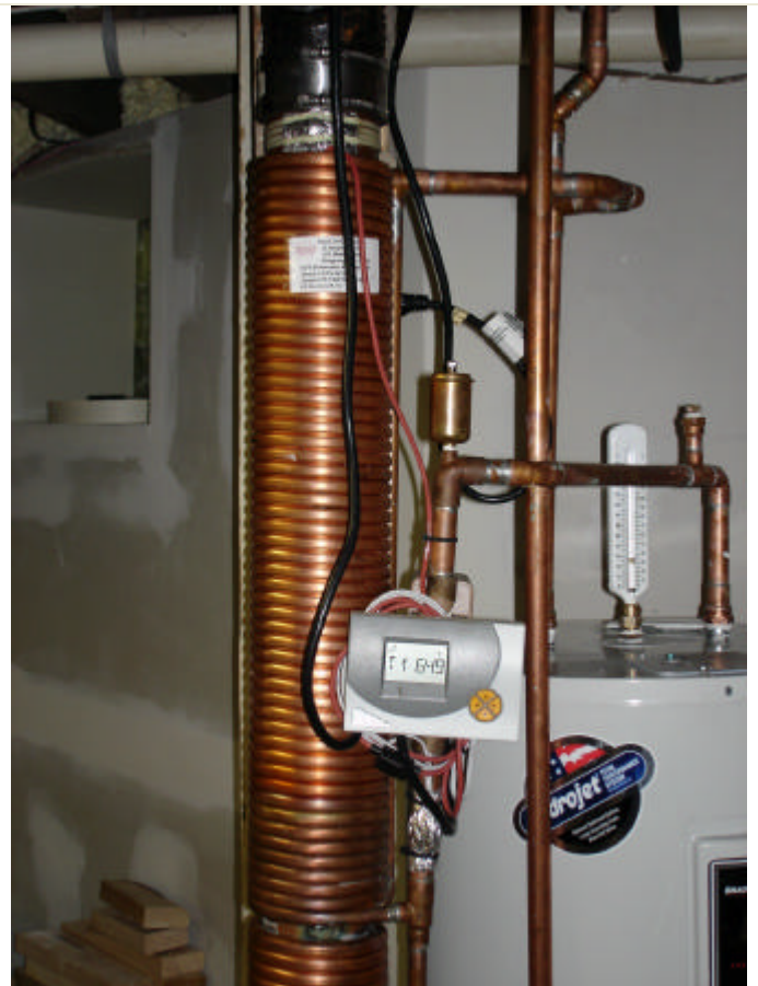
Fig. 2 Close-up of Delta-T controller