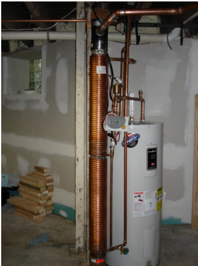
Fig. 1 GFX-Star Using an S3-60 & Disconnected Electric Water Heater For Storing Preheated Water