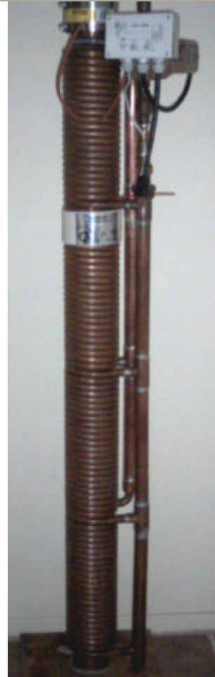
Fig. 2 GFX-STAR™ Model GS-G3-52-4-006