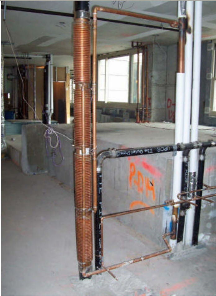
Fig. 1 Model G4-80-4 GFX

The Octagon was designed to achieve a Silver LEED rating and received an award from the EPA and the DEP for leadership in applying sustainable design principles to residential development